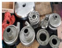
Hastelloy alloy pump parts2