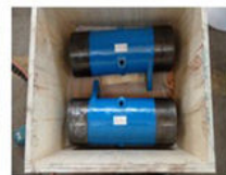
Special bearing house