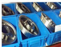
Special expeller ring