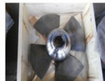
Alloy 20 pump parts2