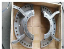
Alloy 20 pump parts4