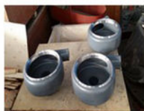
Hastelloy alloy pump parts