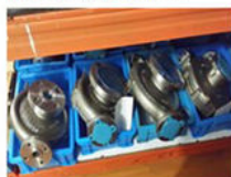
Special pump body