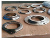
Alloy 20 pump parts1