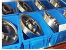
Special expeller ring