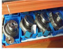
Special pump body