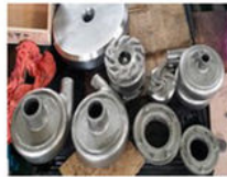
Hastelloy alloy pump parts2