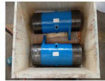
Special bearing house