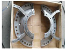
Alloy 20 pump parts4