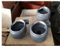
Hastelloy alloy pump parts