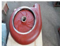
A61 slurry pump parts