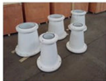
A05 material Cyclone Cone